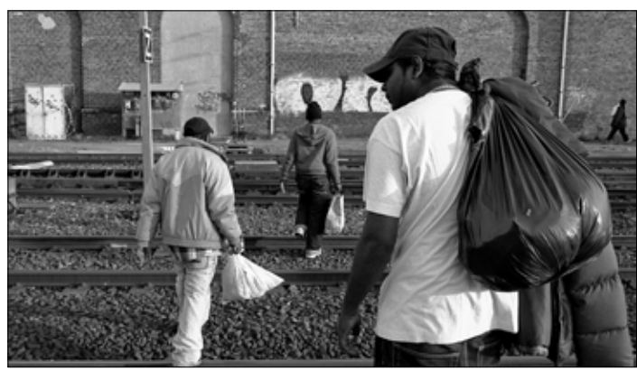
Migrants cross train tracks near a makeshift camp known as 'the Jungle', before its demolition by French police in September

Around 2000 migrants living in Calais are under threat of eviction and deportation. Activists, locals and migrants are working to oppose police brutality, deportations and the destruction