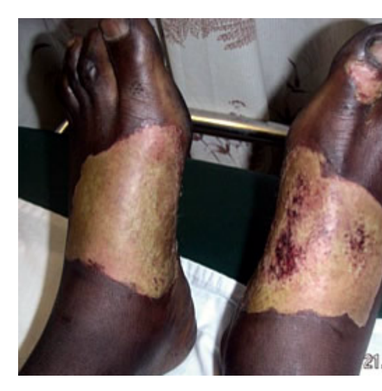
Victims of violence are being prevented from accessing medical assistance by ZRP.