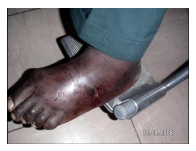
This man has a badly broken foot.