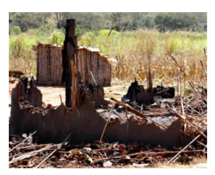
Wanton distruction of homes and property on Muniya (formerly Envant) Farm.

Many of the evicted farm workers are sleeping in the open, surrounded by whatever belongings they were able to take out with them. There are 106 children under the age of 12 and 113 adults, many of whom are elderly. They share a single toilet and have limited access to running water.