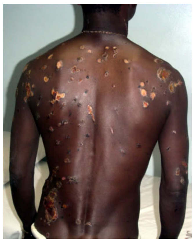
Cruel and inhuman treatment was meted out to this man and his livestock.

This man (left) managed to get in to Harare from UMP after three days. He had burning plastic put on his back and arms. His home was burned and his animals were doused in diesel and burned alive.